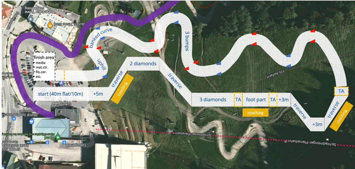
Racetrack Sprintrace: Height difference 70 m